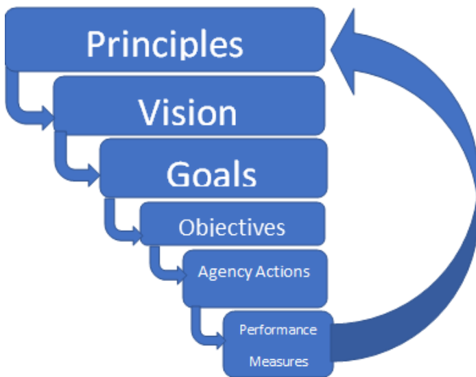
Figure 1. Vision Zero Planning Framework

An effective plan is rooted in scientific principles, aligned with the broader community vision, and organized with a hierarchy of connected vision, goals, objectives, agency actions, and performance measures (Figure 1).